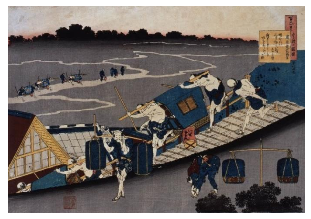
Poem by Fujiwara no Michinobu Ason, from the series One Hundred Poems Explained by a Nurso

Express messengers, sedan-chair bearers—this section presents people engaged in moving people and things from one place to another. Today, we mainly use cars and trucks, ships, and airplanes for transport; relying on human strength itself has become rare. Ships were used to transport goods in the Edo period, too, but much transport was carried out without relying on machines. It was hard work for people to haul things themselves or use horses or other animals to carry them, but here we can also see people working in concert, sharing their burdens.