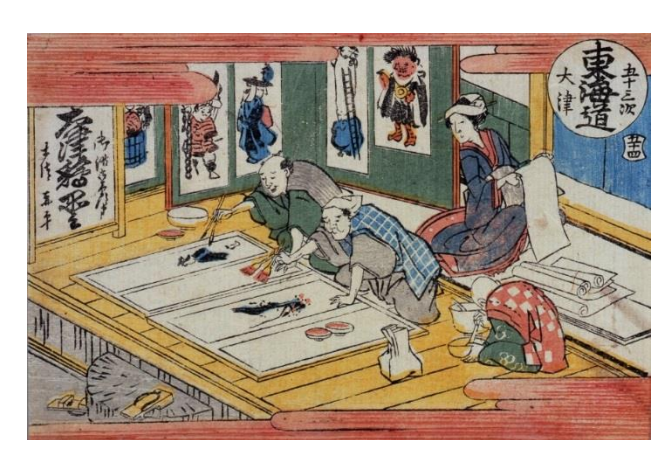
\bar{O}tsu , from the series The Fifty-three Stations, Coming and Going to Edo