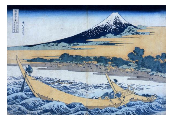
Simplified View of Tagonoura Beach at Ejiri on the Tōkaidō Road, from the series Thirty-six Views of Mount Fuji

This section introduces fishermen, loggers, and others whose work consists of harvesting resources from the natural world. Livelihoods that require engaging directly with nature can mean working in harshly demanding environments. Hokusai's images, however, do not focus on the grimness of those environments. Rather, he is intrigued by them and depicts them in bold compositions. The energetic bodies of people toiling away and their relaxed expressions when taking a break from work are among the pleasures Hokusai's views of people working in the natural world present.