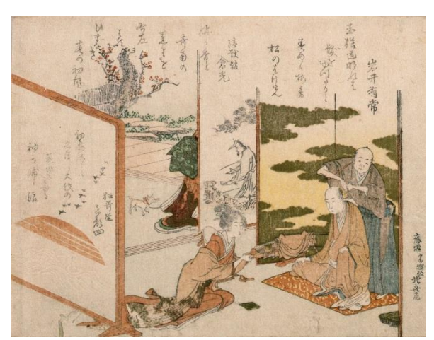
Dressing a samurai's Hair