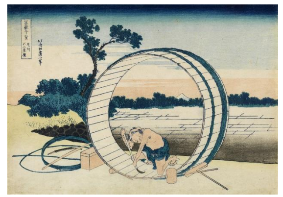
Fujimigahara in Owari Province, from the series Thirty-six Views of Mount Fuji