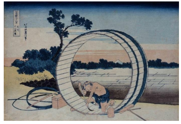
Fujimigahara in Owari Province, from the series Thirty-six Views of Mount Fuji

This section presents people with superb skills, from coopers to painters. Today, with innovations such as 3D printing, the mechanization of production is accelerating, but in Hokusai's day, everything was made by hand. Another striking difference is the position of painters and others whose occupations today would define them as artists. In the Edo period, a painter was regarded as a craftsman. Giving thought to those differences in the nature of society will add extra interest to your exploration of Hokusai's views of craftsmen in Edo.