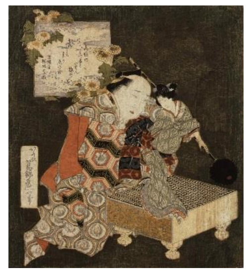
Puppet on Go Board

In this section, Edo's entertainers, including both Kabuki actors and street performers, take the stage. In an age without television or the many other sources of entertainment we enjoy today, performers played an important role in bringing spice to everyday lives. Since many Edo performing arts live on today, the scenes in these depictions may be familiar. Hokusai captured these entertainers' appearances so vividly that we can almost hear the music, the dialogue, the buzz of the audience. From acts that are utterly astonishing to performances of great elegance, Edo entertainers are a great delight.