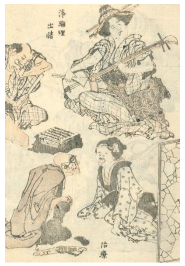
Medical Treatment, from "Sketches by Hokusai, Vol. 12"

This section introduces occupations—from physicians to collectors of paper for recycling—that the categories in the earlier sections cannot encompass. It also includes group portraits of a variety of livelihoods. Knowing how they made their livings helps us imagine the worldly wisdom they shared and what their lifestyles were. After looking at all the images in this exhibition, we trust that you will have a vivid image of how the people depicted in these <code>ukiyo-e</code> lived and be more engaged with the Edo world than ever before.