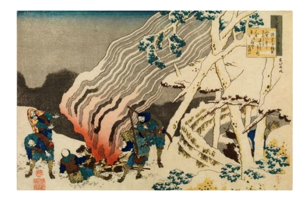
{\it Minamoto\ no\ Muneyuki\ Ason,\ from\ the\ series\ One\ Hundred\ Poems\ Explained\ by\ a\ Nurse}