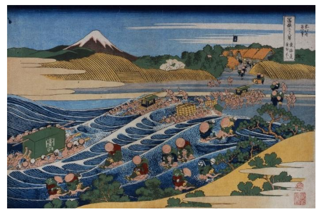
Mount Fuji from Kanaya on the Tōkaidō Road, from the series Thirty-six Views of Mount Fuji